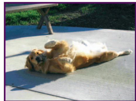
Come meet Rvier, our official Greeter